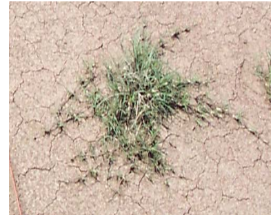
Figure 3, Spreading buffalograss stolons