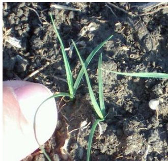
Figure 2, Buffalograss Seedlings